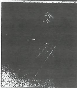
HIGH FLIER: A skier in action at the Tamworth ski centre