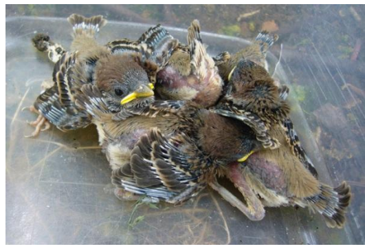
Tree Sparrow Chicks about to be ringed before being returned to their Nest Box

In order to try to learn something more about site fidelity and movements, the later broods of chicks from 2005 were also colour ringed. Colour rings can be recorded without re-trapping the birds and so there is a much greater chance of them being reported. The chicks colour ringed in 2005 had a yellow ring and a metal ring on their right leg and a bicoloured yellow and green ring on their left leg. However, after fledging they were never seen again and are presumed to have moved to new areas.