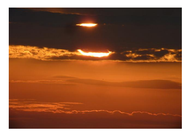
Dolphins & Sunset at Porth Ysgaden

The following day we made the drive to South Stack on Anglesey, the weather forecast was good so a perfect day was