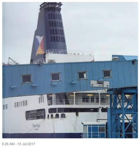
Q 11 0